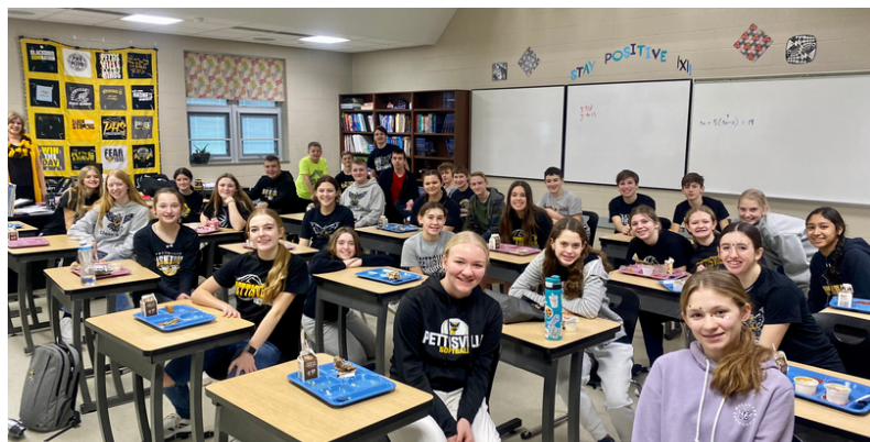
Pettisville Middle School meets during lunch, and the students challenge and encourage each other with God's Word.